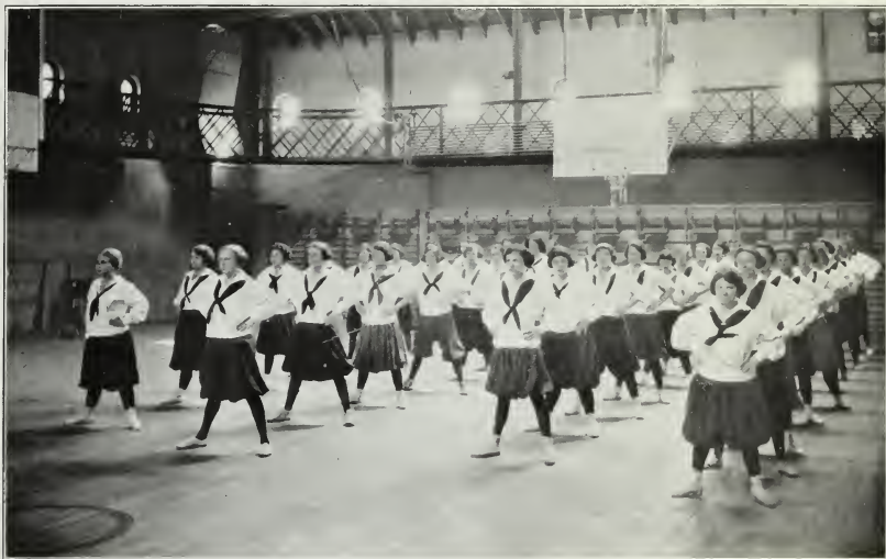
GIRLS UNIFORMLY IMPROVE IN HEALTH AT MIAMI